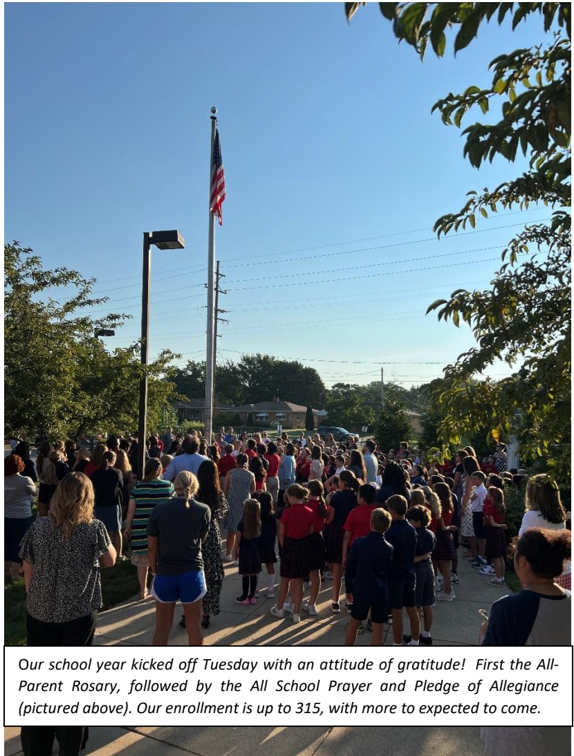
Our school year kicked off Tuesday with an attitude of gratitude! First the All-Parent Rosary, followed by the All School Prayer and Pledge of Allegiance (pictured above). Our enrollment is up to 315, with more to expected to come.